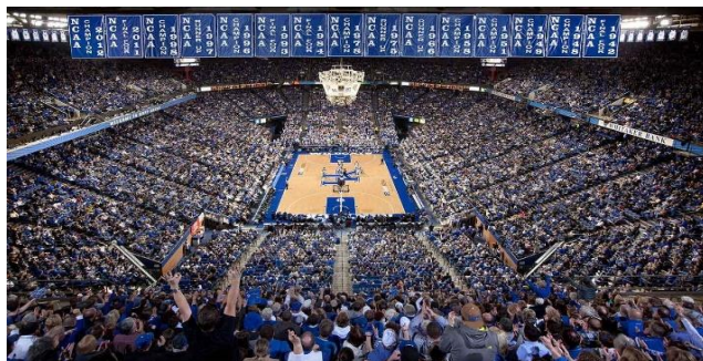
Rupp Arena.

The University of Kentucky athletics program provides sporting events year round. Rupp Arena is the home court of the University of Kentucky Wildcats, the 2012 NCAA Men's College Basketball National Champions. It is one of the largest arenas of its kind and it is located in the heart of the downtown area.