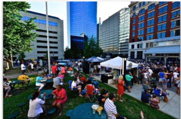
Thursday Night Live.

In the heart of downtown, the Fifth Third Pavilion at Cheapside Park operates weekly events and supports a vibrant nightlife. Thursday Night Live, an outdoor live music event, is held weekly from April to October at the Pavilion and attracts an average of 2,300 people each week. Every Saturday, over 3,000 people visit the Farmers’ Market at the Pavilion to purchase local produce, meats, cheeses, and other products while enjoying downtown.