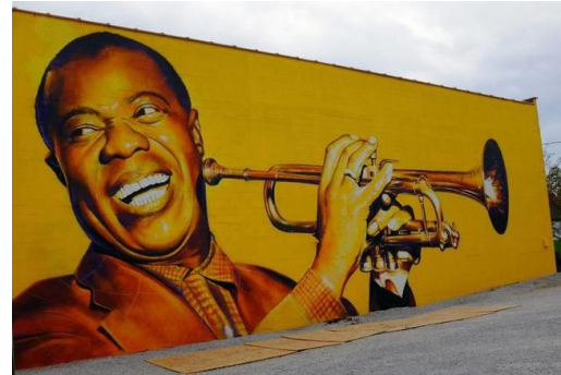
Louis Armstrong mural.

Located on 15 acres just one mile outside of downtown, the Lexington Distillery District is a collection of historical industrial buildings with unique attractions, including shops and art spots, and vivid street art by PRHBTN. Art, ceramic creations, hand-stamped cards, and unique jewelry made by Kentucky artisans are for sale at Made KY, and nearby M.S. Rezny Studio and Gallery features photography, collage, paintings, and other art media. Visitors can also eat dinner at the Middle Fork Kitchen Bar, enjoy craft ice cream such as Bourbon & Honey at the Crank and Boom Dessert Café and Lounge, sit on the patio at the craft microbrewery Ethereal Brewing, or relax and play corn hole on the Break Room's patio.