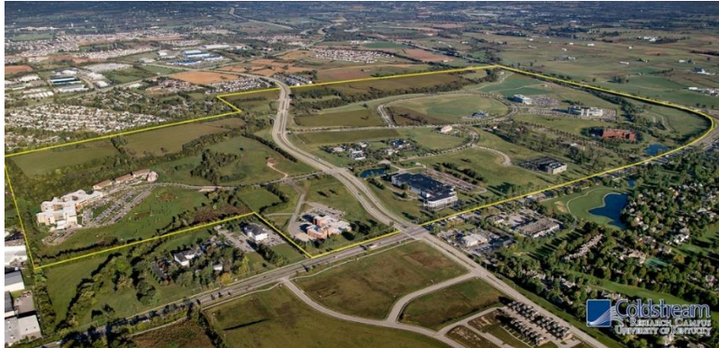
Aerial of Coldstream Research Campus. – See webpage for a map of Coldstream Research Campus.

UK's Coldstream Research Campus is a premier business location designed to recruit high-tech and biotech companies, and to house university centers and startups. Coldstream is home to 66 companies and over 2,000 employees working in biotechnology, pharmaceutical, software and IT, and a variety of other industries.