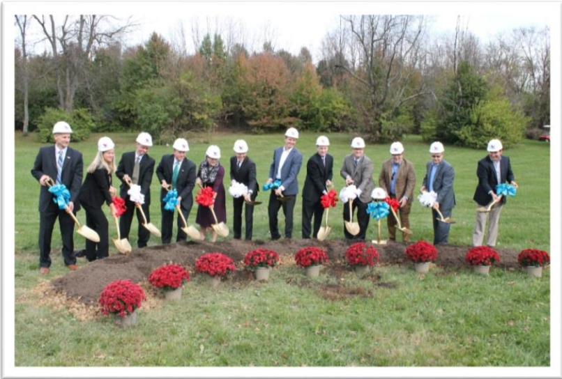
Groundbreaking for Ashland's new 162,400 square foot office building, serving as the global headquarters for Valvoline USA (2015).

Inc. Magazine's Hire Power Awards (2012) as a top private job creators in America, has consistently appeared on the Inc. 5000 list of the most entrepreneurial and fastest growing companies in America, and was named one of the Best Place to Work by the Kentucky Chamber of Commerce. In 2014, Creative Lodging Solutions invested $5.5 million to locate in a larger building, and created 120 new jobs.